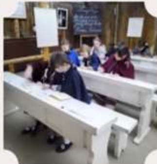
Students at St Alipius practicing handwriting in the Queen's Copperplate.

In Week 1, the Grade 5s visited Sovereign Hill to experience 1850s education in the Goldfields. Students in 5W spent two days attending the St Alipius Digging School, while the Wesleyen Day School hosted the students from 5WG. Students participated in many lessons that were taught to students during the Gold Rush.