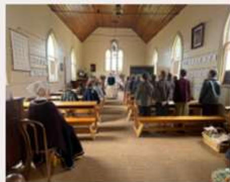
Students attending the Wesleyen Church for their daily lessons.