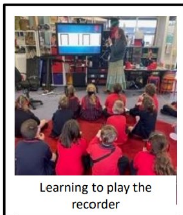
Learning to play the recorder