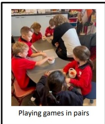
Playing games in pairs