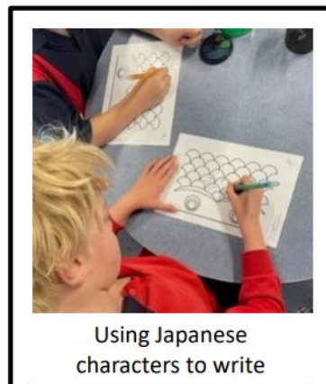
Using Japanese characters to write