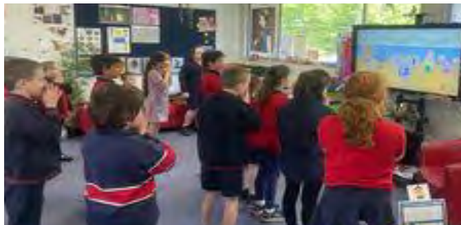
"Head, Shoulders, Knees & Toes"