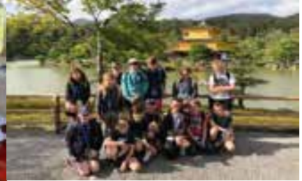
Grade 5/6 Japan Tour 2019: Going