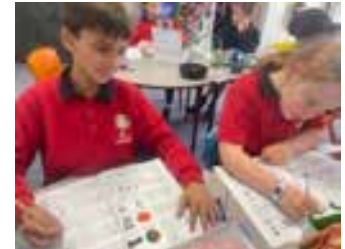
Hiragana books: 5 per week