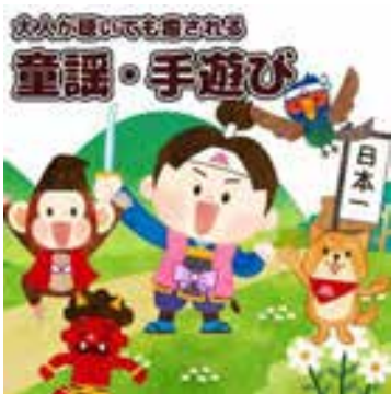
Momotarou (Peach boy)